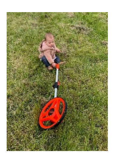
Our littlest (and the cutest) member helping out at All Ford Day!