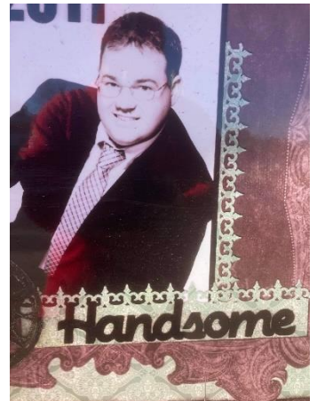
Doppleganger Alert! Spotted at Murry Bridge, who knew our Vice President used to model!